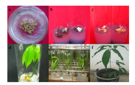
Figure 1. Different stages of putative transgenic plant regeneration in H. brasiliensis . a: H. brasiliensis anther callus prepared for transformation by microparticle bombardment; b: embryo induced from callus after transformation; c: development of embryoid; d: plantlet induced from embryoid; e: plantlets with kanamycin resistance and GUS -positive propagated in tube; f: transgenic plants were transplanted in the pot. The effect of shooting distance on genetic transformation

A total of 560 good callus tissues with two-day pre-cultivation were bombarded. The 1100 psi helium pressure interacting with two target distances (9 cm and 6 cm) were performed. After 30 d, the embryoid induction rate reached 3.21% when shot at a 9 cm distance. However, the embryo can hardly be induced when shot at a 6 cm distance (Table 1).